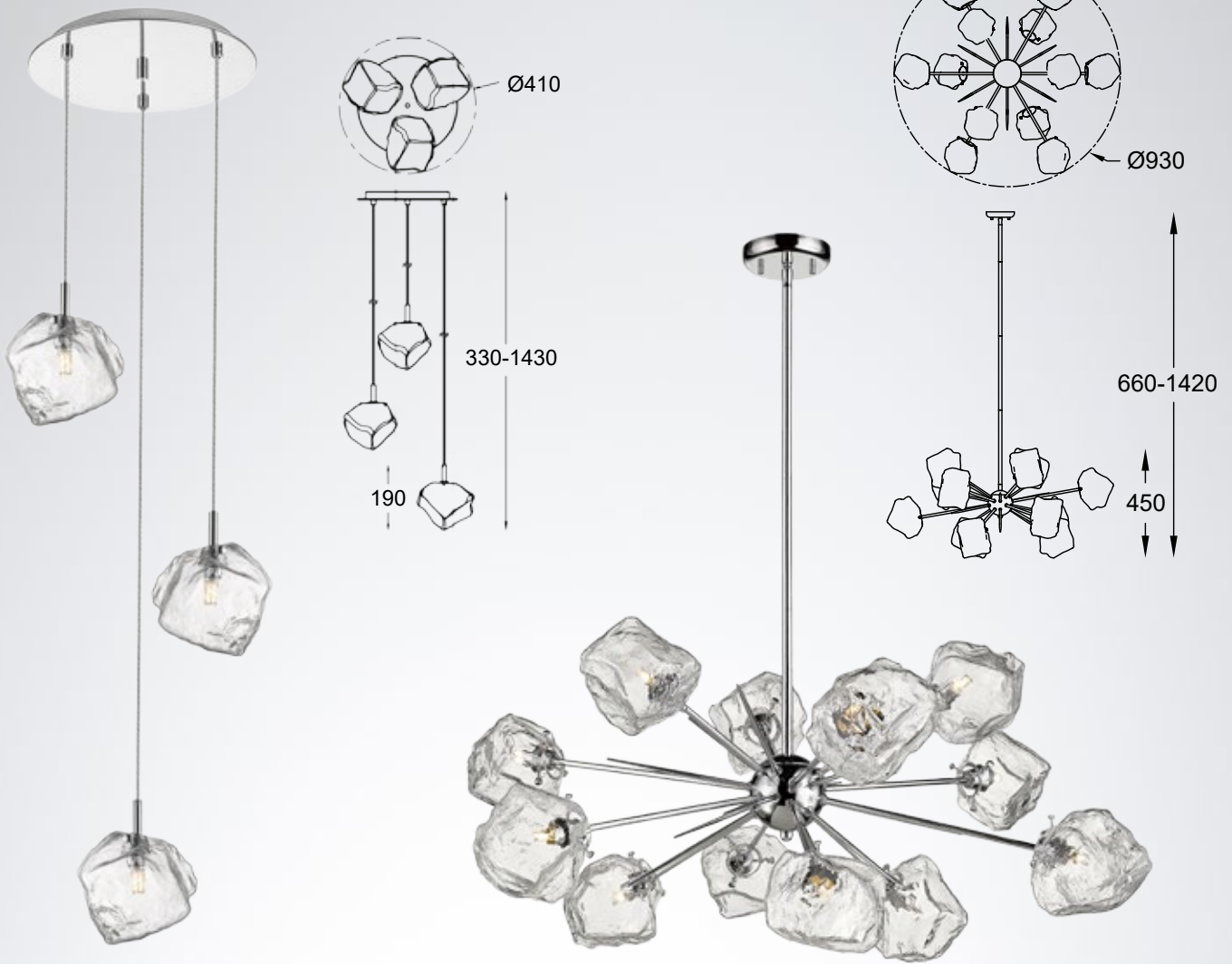
ROCK Pendant lamp P0488-03D-B5AC 3xG9 MAX 28W metal chrome body, crushed glass shade