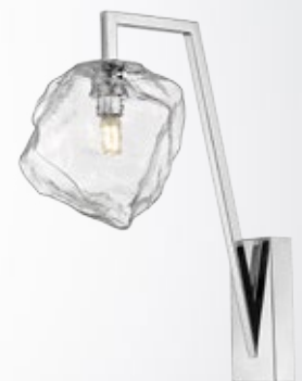
ROCK new Wall lamp W0488-01E-F4AC 1xG9 MAX 28W metal chrome body, crushed glass shade