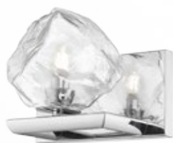
ROCK Wall lamp W0488-01A-B5AC 1xG9 MAX 42W metal chrome body, crushed glass shade