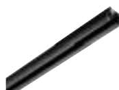
S-TRACK 3-circuit surface mounted track, DALI, 3m