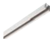
S-TRACK 3-circuit surface mounted track, DALI, 3m