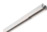
S-TRACK 3-circuit surface mounted track, DALI, 2m