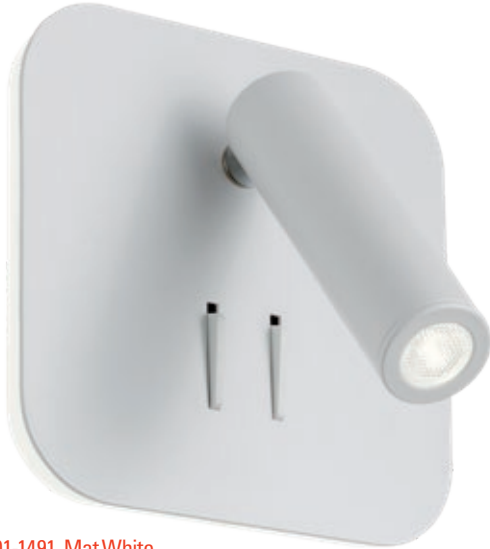
art. 01-1491 Mat White art. 01-1492 Mat Black