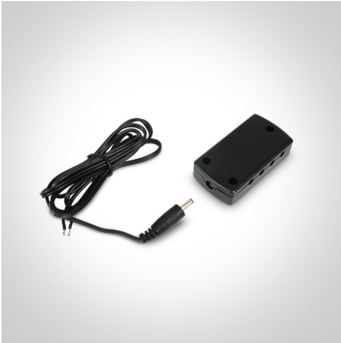
8-WAY CONNECTION BOX 24v