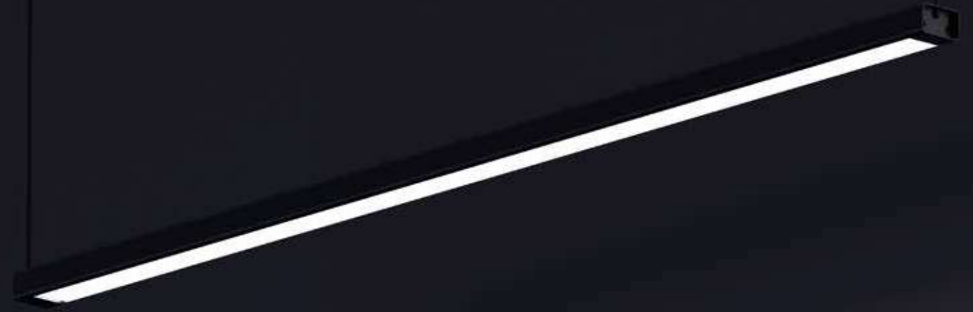
H LED 10690