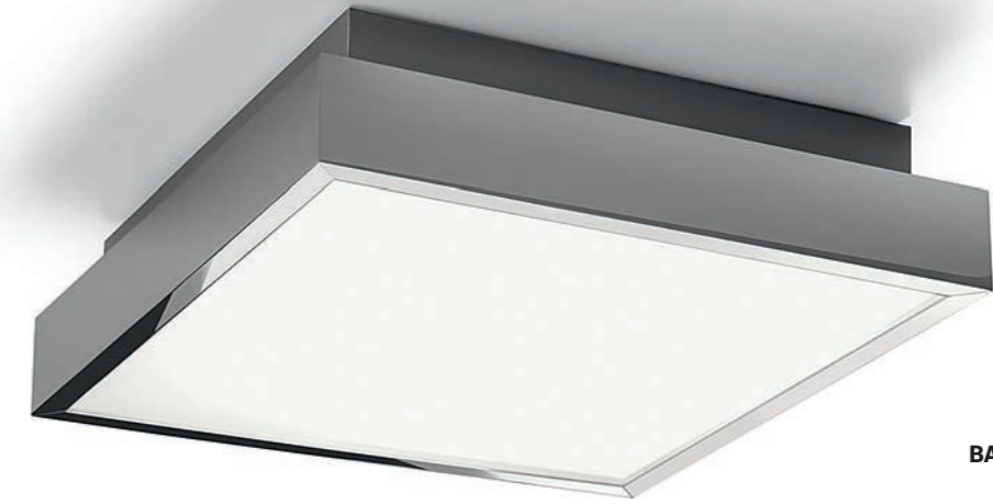
BASSA LED 9500 CH