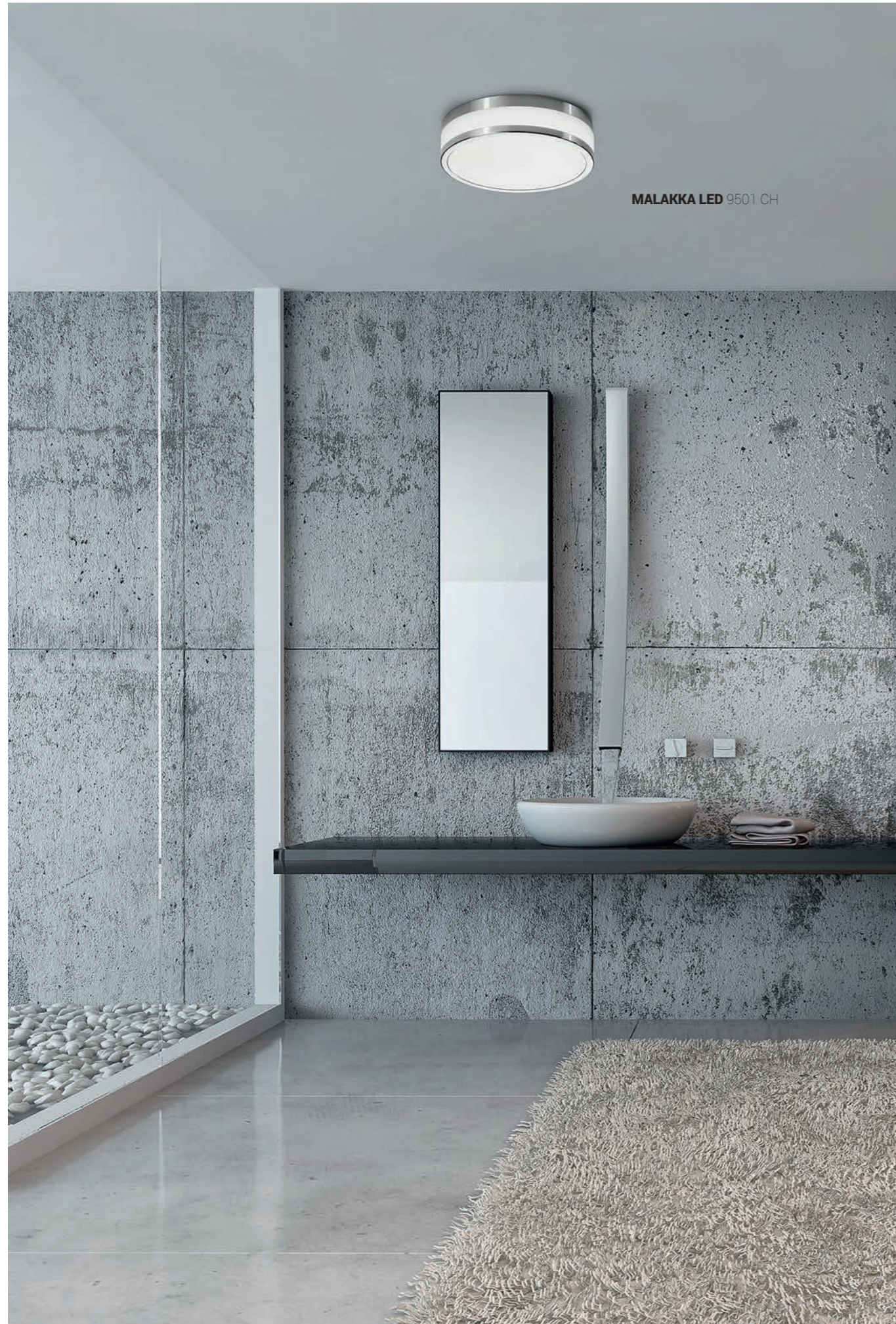
MALAKKA LED 9501 CH