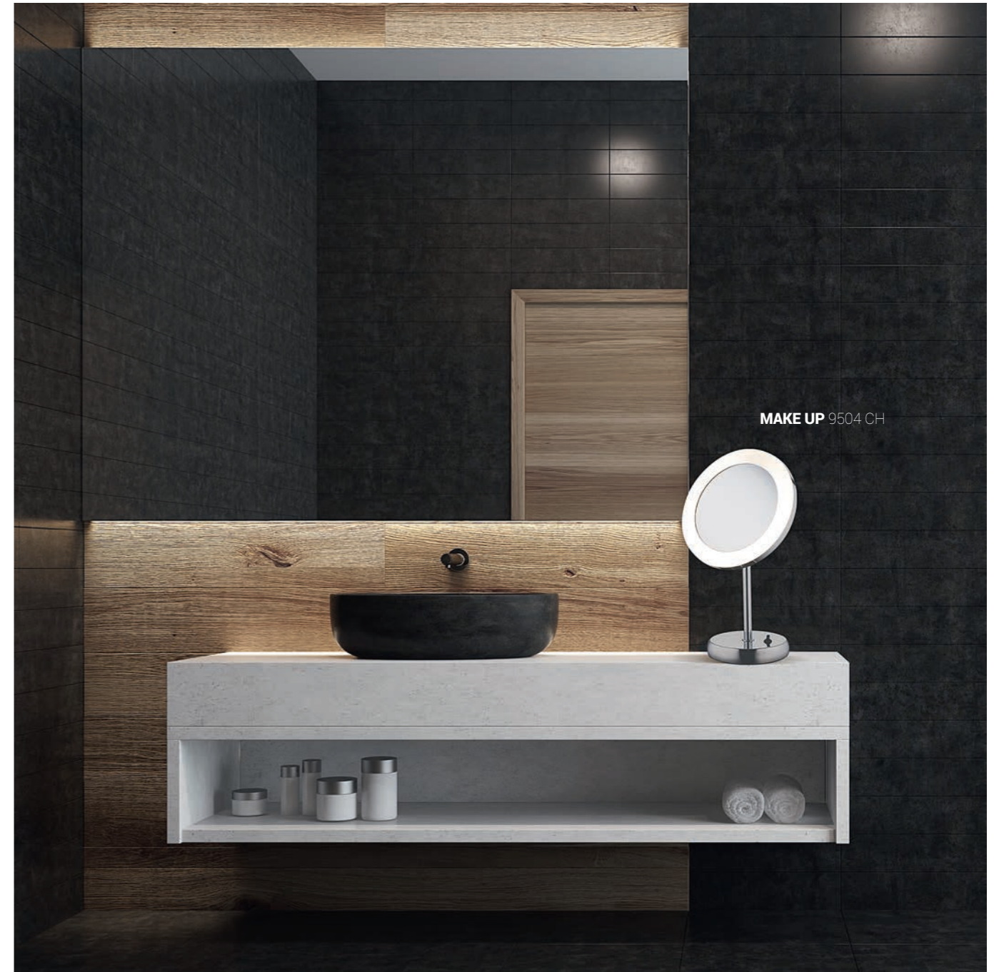
MAKE UP 9504 CH