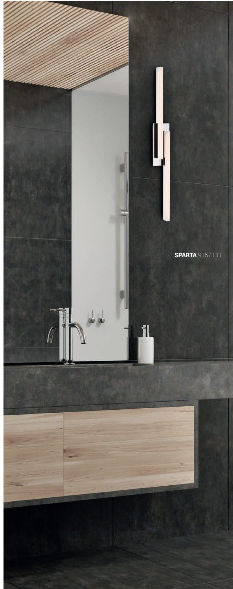
SPARTA 9157 CH