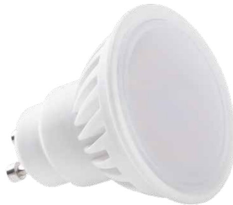
TEDI MAX LED GU10-CW