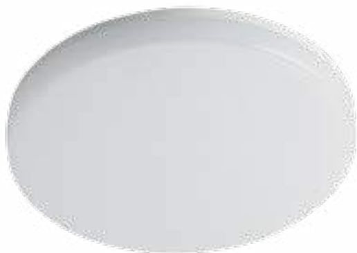
VARSO LED 18W-O; VARSO LED 18W-O-SE