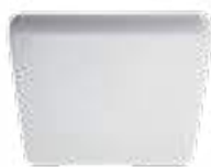
VARSO LED 18W-L; VARSO LED 18W-L-SE