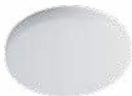
VARSO LED 24W-O; VARSO LED 24W-O-SE