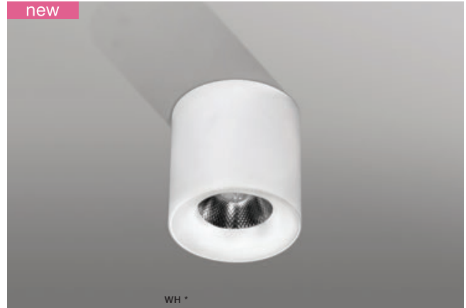
MANE 30W DIMM