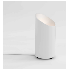
CODE: 1412001 FINISH: MATT WHITE