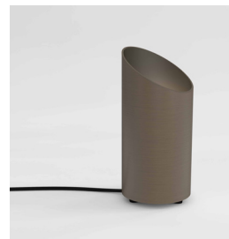
CODE: 1412003 FINISH: BRONZE

TO MAINTAIN THIS PRODUCT TO ITS BEST CONDITION, PLEASE VIEW OUR CARE AND CLEANING GUIDE ON THE SUPPORT SECTION OF THE ASTRO WEBSITE.