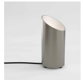
CODE: 1412002 FINISH: MATT NICKEL