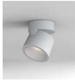
CODE: 1403001 FINISH: MATT WHITE