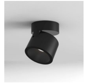
CODE: 1403002 FINISH: MATT BLACK

TO MAINTAIN THIS PRODUCT TO ITS BEST CONDITION, PLEASE VIEW OUR CARE AND CLEANING GUIDE ON THE SUPPORT SECTION OF THE ASTRO WEBSITE.