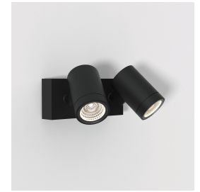
CODE: 1401002 (8303) FINISH: TEXTURED BLACK