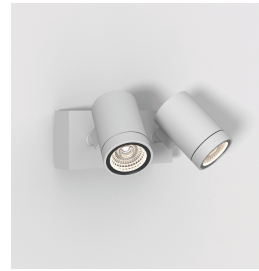
CODE: 1401001 (8302) FINISH: TEXTURED WHITE