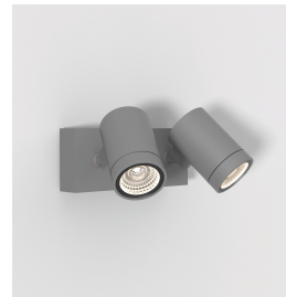
CODE: 1401003 (8304) FINISH: TEXTURED GREY

THIS PRODUCT IS SUITABLE FOR ONEROUS ENVIRONMENTS AND CAN BE INSTALLED WITHIN FIVE MILES OF THE COAST - THREE YEAR WARRANTY APPLIES.