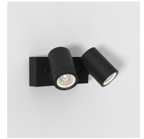
CODE: 1401002 (8303) FINISH: TEXTURED BLACK