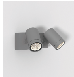
CODE: 1401003 (8304) FINISH: TEXTURED GREY

THIS PRODUCT IS SUITABLE FOR ONEROUS ENVIRONMENTS AND CAN BE INSTALLED WITHIN FIVE MILES OF THE COAST - THREE YEAR WARRANTY APPLIES.