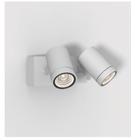
CODE: 1401001 (8302) FINISH: TEXTURED WHITE