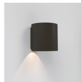
CODE: 1399008 (8430) FINISH: BRONZE

TO MAINTAIN THIS PRODUCT TO ITS BEST CONDITION, PLEASE VIEW OUR CARE AND CLEANING GUIDE ON THE SUPPORT SECTION OF THE ASTRO WEBSITE.