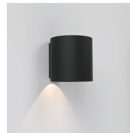
CODE: 1399006 (8428) FINISH: TEXTURED BLACK