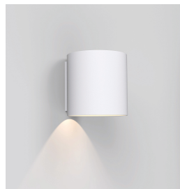
CODE: 1399005 (8427) FINISH: TEXTURED WHITE