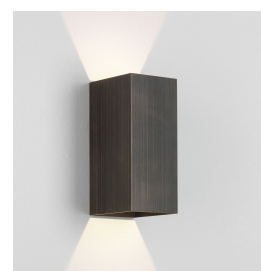
CODE: 1398008 (8170) FINISH: BRONZE LUMENS: 322 EFFICACY 28

TO MAINTAIN THIS PRODUCT TO ITS BEST CONDITION, PLEASE VIEW OUR CARE AND CLEANING GUIDE ON THE SUPPORT SECTION OF THE ASTRO WEBSITE.