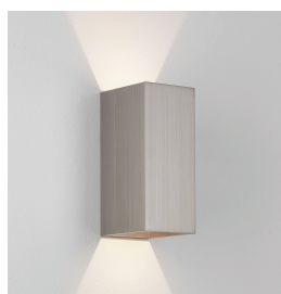
CODE: 1398007 (8169) FINISH: MATT NICKEL LUMENS: 677 EFFICACY 58