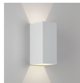
CODE: 1398006 (8168) FINISH: TEXTURED WHITE LUMENS: 677 EFFICACY 58