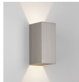
CODE: 1398007 (8169) FINISH: MATT NICKEL LUMENS: 677 EFFICACY 58