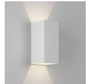
CODE: 1398006 (8168) FINISH: TEXTURED WHITE LUMENS: 677 EFFICACY 58