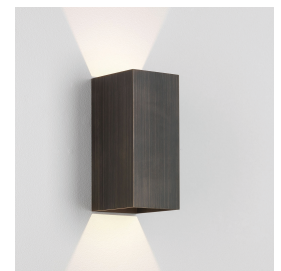
CODE: 1398008 (8170) FINISH: BRONZE LUMENS: 322 EFFICACY 28

TO MAINTAIN THIS PRODUCT TO ITS BEST CONDITION, PLEASE VIEW OUR CARE AND CLEANING GUIDE ON THE SUPPORT SECTION OF THE ASTRO WEBSITE.