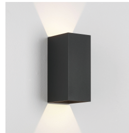
CODE: 1398005 (8167) FINISH: TEXTURED BLACK LUMENS: 322 EFFICACY 28