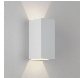
CODE: 1398006 (8168) FINISH: TEXTURED WHITE LUMENS: 677 EFFICACY 58