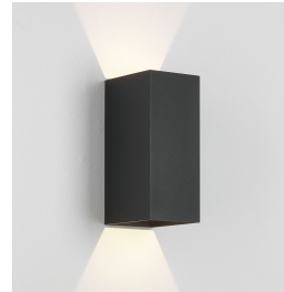
CODE: 1398005 (8167) FINISH: TEXTURED BLACK LUMENS: 322 EFFICACY 28