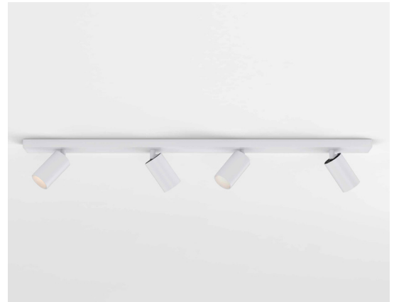
CODE: 1396013 (6176) FINISH: MATT WHITE

TO MAINTAIN THIS PRODUCT TO ITS BEST CONDITION, PLEASE VIEW OUR CARE AND CLEANING GUIDE ON THE SUPPORT SECTION OF THE ASTRO WEBSITE.