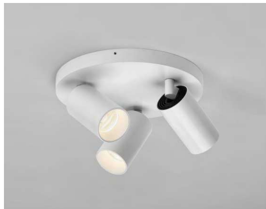
CODE: 1396006 (6166) FINISH: MATT WHITE

TO MAINTAIN THIS PRODUCT TO ITS BEST CONDITION, PLEASE VIEW OUR CARE AND CLEANING GUIDE ON THE SUPPORT SECTION OF THE ASTRO WEBSITE.