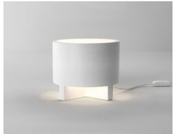
CODE: 1395002 (8300) FINISH: PLASTER

TO MAINTAIN THIS PRODUCT TO ITS BEST CONDITION, PLEASE VIEW OUR CARE AND CLEANING GUIDE ON THE SUPPORT SECTION OF THE ASTRO WEBSITE.