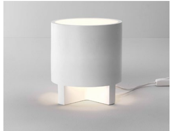
CODE: 1395001 FINISH: PLASTER

TO MAINTAIN THIS PRODUCT TO ITS BEST CONDITION, PLEASE VIEW OUR CARE AND CLEANING GUIDE ON THE SUPPORT SECTION OF THE ASTRO WEBSITE.