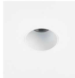
CODE: 1392017 FINISH: MATT WHITE