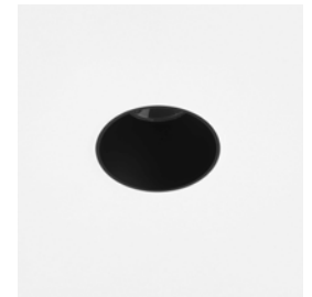
CODE: 1392018 FINISH: MATT BLACK

TO MAINTAIN THIS PRODUCT TO ITS BEST CONDITION, PLEASE VIEW OUR CARE AND CLEANING GUIDE ON THE SUPPORT SECTION OF THE ASTRO WEBSITE.