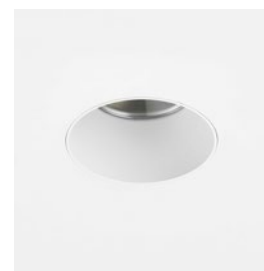
CODE: 1392019 FINISH: MATT WHITE

TO MAINTAIN THIS PRODUCT TO ITS BEST CONDITION, PLEASE VIEW OUR CARE AND CLEANING GUIDE ON THE SUPPORT SECTION OF THE ASTRO WEBSITE.