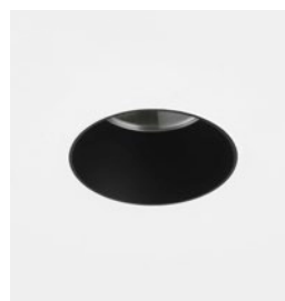
CODE: 1392016 FINISH: MATT BLACK