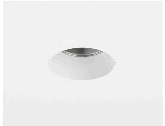
CODE: 1392003 FINISH: MATT WHITE

TO MAINTAIN THIS PRODUCT TO ITS BEST CONDITION, PLEASE VIEW OUR CARE AND CLEANING GUIDE ON THE SUPPORT SECTION OF THE ASTRO WEBSITE.