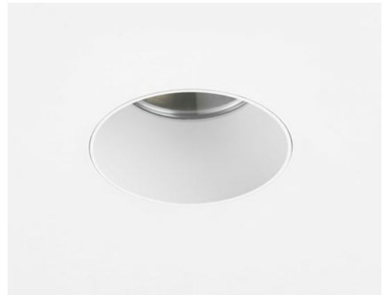
CODE: 1392002 FINISH: MATT WHITE

TO MAINTAIN THIS PRODUCT TO ITS BEST CONDITION, PLEASE VIEW OUR CARE AND CLEANING GUIDE ON THE SUPPORT SECTION OF THE ASTRO WEBSITE.