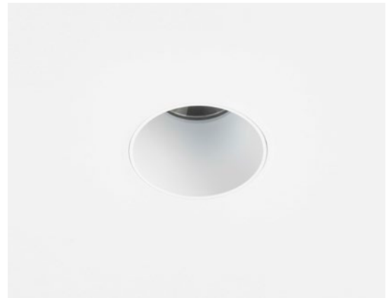
CODE: 1392001 FINISH: MATT WHITE

TO MAINTAIN THIS PRODUCT TO ITS BEST CONDITION, PLEASE VIEW OUR CARE AND CLEANING GUIDE ON THE SUPPORT SECTION OF THE ASTRO WEBSITE.