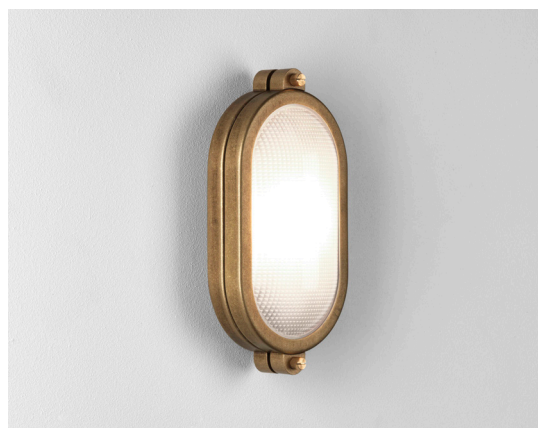
CODE: 1387002 FINISH: ANTIQUE BRASS

THIS PRODUCT IS SUITABLE FOR ONEROUS ENVIRONMENTS AND CAN BE INSTALLED WITHIN FIVE MILES OF THE COAST - THREE YEAR WARRANTY APPLIES.