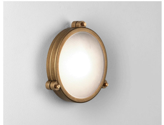
CODE: 1387001 FINISH: ANTIQUE BRASS

THIS PRODUCT IS SUITABLE FOR ONEROUS ENVIRONMENTS AND CAN BE INSTALLED WITHIN FIVE MILES OF THE COAST - THREE YEAR WARRANTY APPLIES.