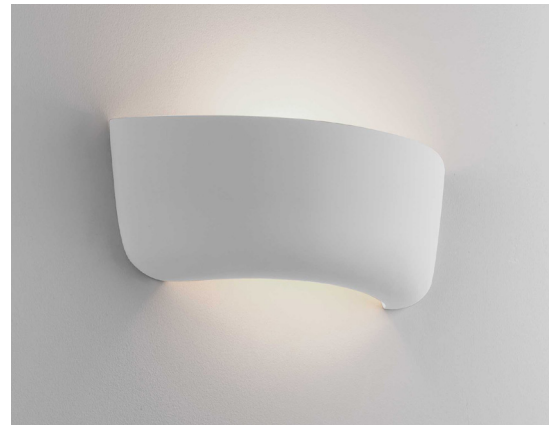
CODE: 1383001 FINISH: CERAMIC

TO MAINTAIN THIS PRODUCT TO ITS BEST CONDITION, PLEASE VIEW OUR CARE AND CLEANING GUIDE ON THE SUPPORT SECTION OF THE ASTRO WEBSITE.