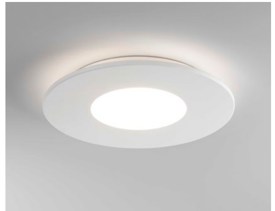
CODE: 1382002 FINISH: MATT WHITE

TO MAINTAIN THIS PRODUCT TO ITS BEST CONDITION, PLEASE VIEW OUR CARE AND CLEANING GUIDE ON THE SUPPORT SECTION OF THE ASTRO WEBSITE.