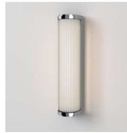
CODE: 1380013 (8556) FINISH: POLISHED CHROME