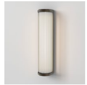
CODE: 1380014 (8544) FINISH: BRONZE