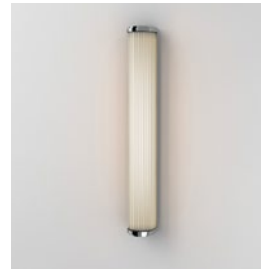
CODE: 1380011 (8482) FINISH: POLISHED CHROME