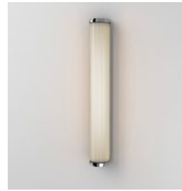
CODE: 1380011 (8482) FINISH: POLISHED CHROME