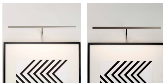
CODE: 1374006 (7889) FINISH: MATT NICKEL