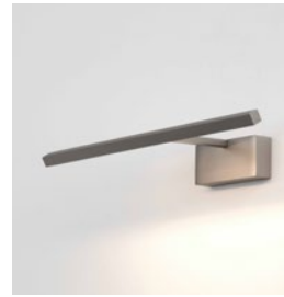
CODE: 1374001 FINISH: MATT NICKEL