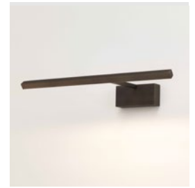
CODE: 1374018 FINISH: BRONZE

TO MAINTAIN THIS PRODUCT TO ITS BEST CONDITION, PLEASE VIEW OUR CARE AND CLEANING GUIDE ON THE SUPPORT SECTION OF THE ASTRO WEBSITE.