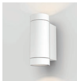
CODE: 1372012 FINISH: TEXTURED WHITE