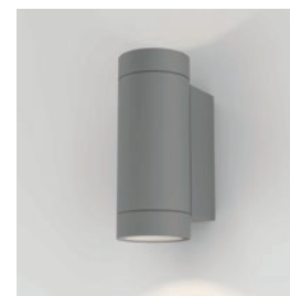
CODE: 1372013 FINISH: TEXTURED GREY