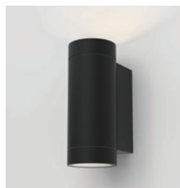
CODE: 1372014 FINISH: TEXTURED BLACK

THIS PRODUCT IS SUITABLE FOR ONEROUS ENVIRONMENTS AND CAN BE INSTALLED WITHIN FIVE MILES OF THE COAST - THREE YEAR WARRANTY APPLIES.