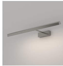
CODE: 1371015 (8581) FINISH: MATT NICKEL