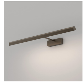
CODE: 1371016 (8582) FINISH: BRONZE

TO MAINTAIN THIS PRODUCT TO ITS BEST CONDITION, PLEASE VIEW OUR CARE AND CLEANING GUIDE ON THE SUPPORT SECTION OF THE ASTRO WEBSITE.