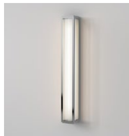
CODE: 1370003 (8329) FINISH: POLISHED CHROME