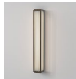
CODE: 1370005 (8331) FINISH: BRONZE

TO MAINTAIN THIS PRODUCT TO ITS BEST CONDITION, PLEASE VIEW OUR CARE AND CLEANING GUIDE ON THE SUPPORT SECTION OF THE ASTRO WEBSITE.