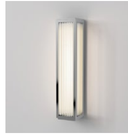
CODE: 1370002 (8328) FINISH: POLISHED CHROME