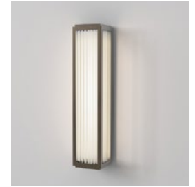
CODE: 1370004 (8330) FINISH: BRONZE

TO MAINTAIN THIS PRODUCT TO ITS BEST CONDITION, PLEASE VIEW OUR CARE AND CLEANING GUIDE ON THE SUPPORT SECTION OF THE ASTRO WEBSITE.