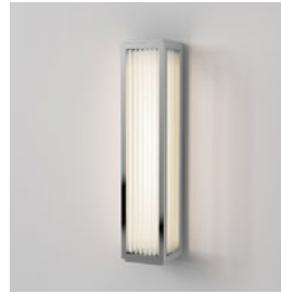
CODE: 1370002 (8328) FINISH: POLISHED CHROME