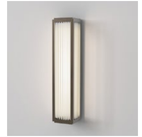
CODE: 1370004 (8330) FINISH: BRONZE

TO MAINTAIN THIS PRODUCT TO ITS BEST CONDITION, PLEASE VIEW OUR CARE AND CLEANING GUIDE ON THE SUPPORT SECTION OF THE ASTRO WEBSITE.