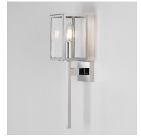
CODE: 1369004 (8191) FINISH: POLISHED NICKEL

THIS PRODUCT IS NOT SUITABLE FOR INSTALLATION WITHIN FIVE MILES OF THE COAST. FOR THESE ENVIRONMENTS, PLEASE FILTER PRODUCTS ON THE ASTRO WEBSITE BY 'COASTAL'.