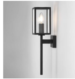
CODE: 1369003 (8190) FINISH: TEXTURED BLACK