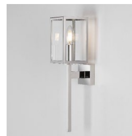
CODE: 1369004 (8191) FINISH: POLISHED NICKEL

THIS PRODUCT IS NOT SUITABLE FOR INSTALLATION WITHIN FIVE MILES OF THE COAST. FOR THESE ENVIRONMENTS, PLEASE FILTER PRODUCTS ON THE ASTRO WEBSITE BY 'COASTAL'.