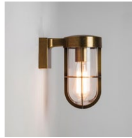
CODE: 1368003 (7559) FINISH: ANTIQUE BRASS