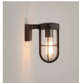
CODE: 1368025 (8275) FINISH: BRONZE

THIS PRODUCT IS NOT SUITABLE FOR INSTALLATION WITHIN FIVE MILES OF THE COAST. FOR THESE ENVIRONMENTS, PLEASE FILTER PRODUCTS ON THE ASTRO WEBSITE BY 'COASTAL'.