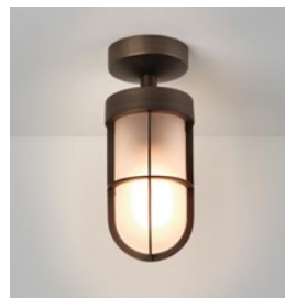
CODE: 1368028 FINISH: BRONZE

THIS PRODUCT IS NOT SUITABLE FOR INSTALLATION WITHIN FIVE MILES OF THE COAST. FOR THESE ENVIRONMENTS, PLEASE FILTER PRODUCTS ON THE ASTRO WEBSITE BY 'COASTAL'.