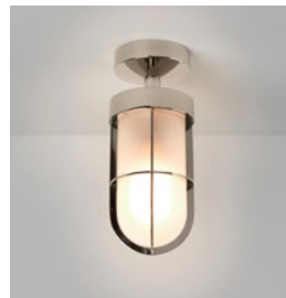
CODE: 1368010 FINISH: POLISHED NICKEL