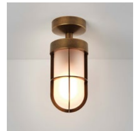
CODE: 1368012 FINISH: ANTIQUE BRASS