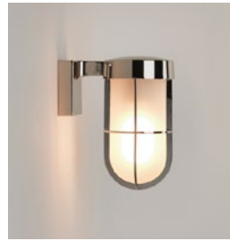
CODE: 1368006 FINISH: POLISHED NICKEL