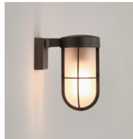
CODE: 1368026 FINISH: BRONZE

TO MAINTAIN THIS PRODUCT TO ITS BEST CONDITION, PLEASE VIEW OUR CARE AND CLEANING GUIDE ON THE SUPPORT SECTION OF THE ASTRO WEBSITE.