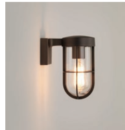
CODE: 1368025 (8275) FINISH: BRONZE

THIS PRODUCT IS NOT SUITABLE FOR INSTALLATION WITHIN FIVE MILES OF THE COAST. FOR THESE ENVIRONMENTS, PLEASE FILTER PRODUCTS ON THE ASTRO WEBSITE BY 'COASTAL'.