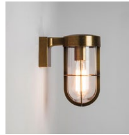
CODE: 1368003 (7559) FINISH: ANTIQUE BRASS