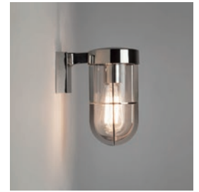
CODE: 1368004 (7560) FINISH: POLISHED NICKEL