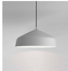
CODE: 1361015 (8574) FINISH: LIGHT GREY

TO MAINTAIN THIS PRODUCT TO ITS BEST CONDITION, PLEASE VIEW OUR CARE AND CLEANING GUIDE ON THE SUPPORT SECTION OF THE ASTRO WEBSITE.