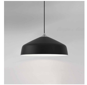
CODE: 1361014 (8573) FINISH: MATT BLACK