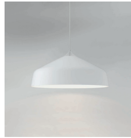
CODE: 1361013 (8572) FINISH: MATT WHITE