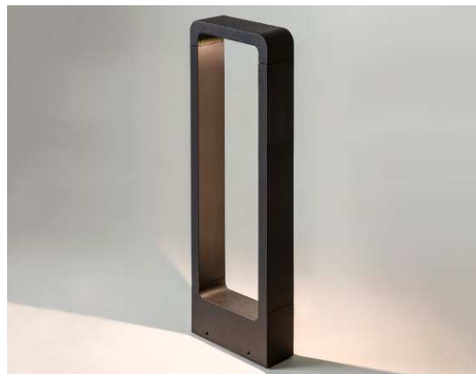
CODE: 1357006 (8005) FINISH: TEXTURED BLACK

THIS PRODUCT IS NOT SUITABLE FOR INSTALLATION WITHIN FIVE MILES OF THE COAST. FOR THESE ENVIRONMENTS, PLEASE FILTER PRODUCTS ON THE ASTRO WEBSITE BY 'COASTAL'.