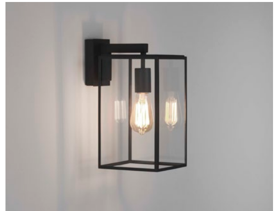
CODE: 1354004 FINISH: TEXTURED BLACK

TO MAINTAIN THIS PRODUCT TO ITS BEST CONDITION, PLEASE VIEW OUR CARE AND CLEANING GUIDE ON THE SUPPORT SECTION OF THE ASTRO WEBSITE.